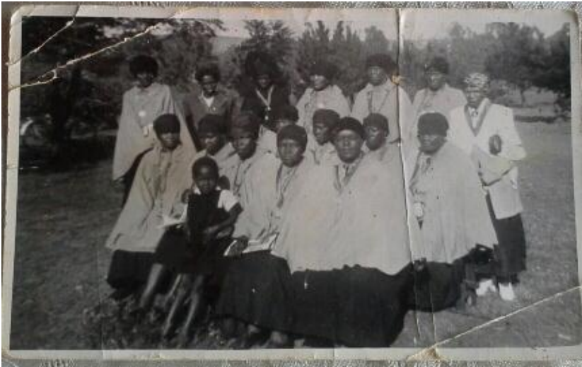
Figure 1: Roman Catholic Women's Prayer Group in Lady Selborne in the 1940s

thereon (Schapera 1951:xviii) and they make ecological laws and decisions on behalf of their community. Ranger confirms that even in Zimbabwe the princess's report to chiefs on environmental matters and that they sit with the chiefs to hear domestic cases and enforce traditional ecological laws (2003:78). Men were also involved in rain-making but the majority of prominent rain specialists were women because they were seen to be closer to nature through the act of childbearing. Rain-making provided an explanation of local climatic conditions and was seen as a means of communicating with the ancestors, God and natural forces. It was an activity grounded in the material necessity to succeed in agriculture. Since most Sotho-Tswana settled near perennial rivers where rainfall was scarce, rain-making ceremonies were seen to be crucial (Anonymous author 1977:108). To illustrate the importance of rain, the Sotho-Tswana greeting is ' pula ' (literary, rain), which refers to water, success and peace. The interviews illustrate that rain is still pivotal in black African areas, but since the emergence of modernity and capitalism people's emphasis in the twentieth century was mainly on the job market in urban areas. The focus is more on women's prayer groups for rain ( bomme ba morapelo ) (see Figure 1).