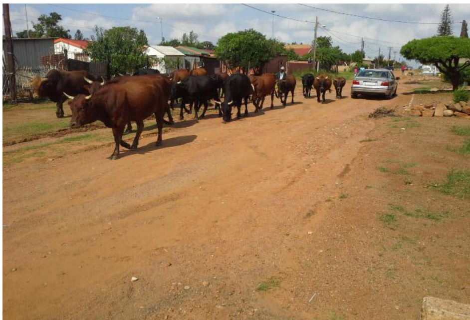
Figure 5: Ga-Rankuwa: type of soil – red, sandy and infertile. Worsened by animal overgrazing.

Forced removals dispossessed women of their attachment to their fertile land in Lady Selborne and this resulted in anger and a history of poverty that proved difficult to mend. Interviewees argued that many black African women became environmentally apathetic as they found themselves in a hopeless situation and this represented an important resistance strategy. Hence Ntsoko claims that environmental apathy was a strategy utilised by the community to fight against the effects of land dispossession with the view that the apartheid government would feel pity on their lot. She states that ‘land makes a woman feel strong like a man and loosing big plots like the ones we had in Lady Selborne made women hurt and angry especially former landlords ( bommastand ). Henceforth we ended up not caring for our environment in Ga-Rankuwa’ (Kgari-Masondo, interview 2014).