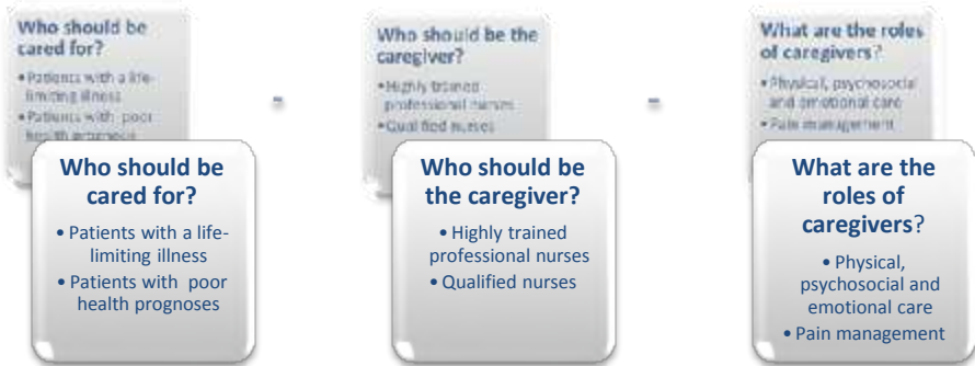
Fig. 1 Palliative care curriculum - a mirror image of the developed world curriculum

care in the absence of equitable, appropriate and sufficient healthcare provisioning.