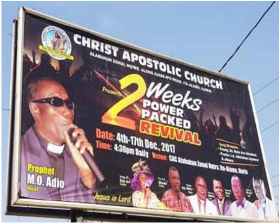
Figure 5: A church advert titled Christ Apostolic Church.

God, and possibly to church members. Cazarin (2017: 471) also notes that the religious titles of preachers often imply a certain set of gifts, skills and expertise.