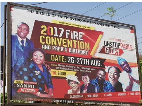
Figure 3: A billboard church advert titled 2017 Fire Convention.

The advert also presents pictures of other ministers, which could also signify corporate anointing. If one man of God represents a vehicle for the transference of God's blessings, the implication is that more men of God equal more blessings. In Christianity, ministers are authorised to perform functions such as the teaching of beliefs, leading of services and providing spiritual guidance to the community.