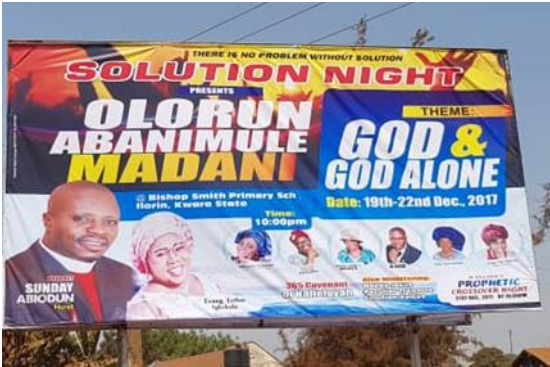
Figure 2: A billboard church advert titled Solution Night.

his ministerial duties. The woman is a divine helper designated by God to help the man of God pursue his calling.