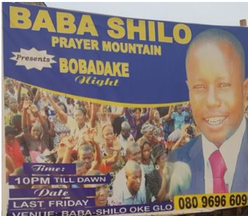
Figure 1: A billboard church advert titled Baba Shilo.

According to Nwanganga (2017: 1), ‘spiritual calling/ direct revelation from God through dreams and visions’ and ‘a search for spiritual development in private mannerism’ account for why there are many churches in Nigeria. This also explains why the man of God is the centre of attraction. People focus on the men of God because of the belief that they can bring healing and other spiritual benefits. People seeking divine healing or divine intervention in their lives throng prayer houses, miracle centres, and crusade meetings. Figure 1 below exemplifies the centrality of the man of God in the lives of the believers.