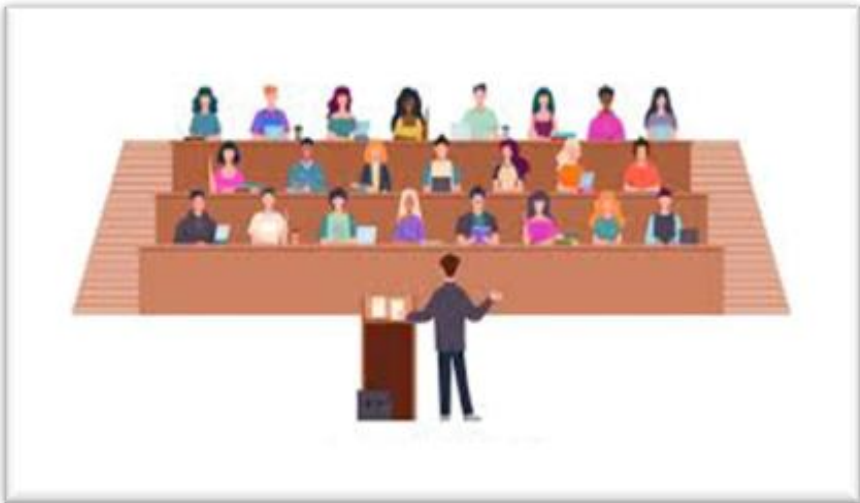
Figure 1. Teaching in a lecture hall 6

The ‘shape’, resultantly, is unaltered. ‘Teaching as we were taught’ has become a ‘way of life’, that is to say, it is a cultural phenomenon: a template for the ways we teach (Owens 2013). Figures 1 and 2 show that, in essence, the default approach, ‘teach as we were taught’, endures. The similarities between face-to-face and faces-in-virtual-space are not accidental – because the way we deploy technology neutralizes the differences between the practices. Furthermore, the practices share common purposes, processes and outcomes. It appears then that the way we deploy technology is an indicator of our unwillingness to stray too far from the comforts of the familiar. In that case, we have to ask, can digital technology produce a different culture of teaching?