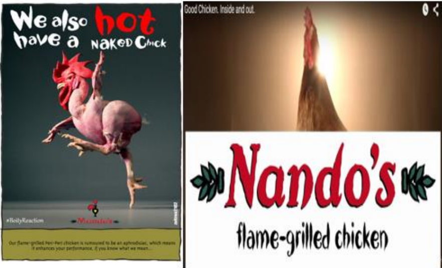
Figure 3: Nandos advertisement as retrieved from the internet: https://www.google.co.za/search?biw=1366&bih=662&tbm=isch&sa=1&q=nandos+adverts&oq=nandos+adverts&gs_l=psy-ab.3...41061.41648.0.42374.0.0.0.0.0.0.0.0.0.0.0.0...0...1.1.64.psy-ab..0.0.0....0.r0MCGDvnLCs#imgcr=7W0HM6l6LnxswM :