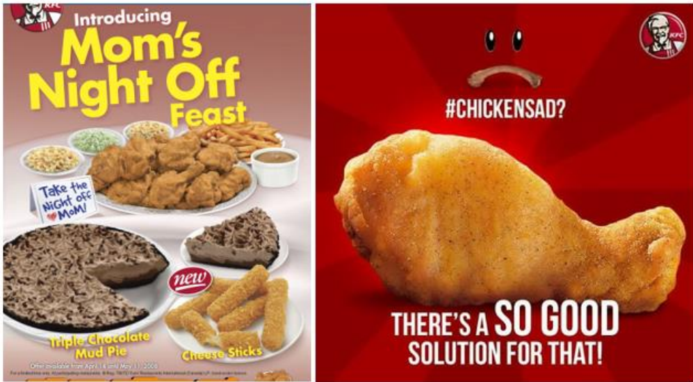
Figure 2: KFC adverts as retrieved from the internet:

https://www.google.co.za/search?biw=1366&bih=662&tbm=isch&sa=1&q=KFC+exaggerated+adverts&oq=KFC+exaggerated+adverts&gs_l=psy-ab.3...11293789.11298590.0.11299138.0.0.0.0.0.0.0.0....0...1.1.64.psy-ab..0.0.0....0.SODPS_jpNlo#imgcr=dZwE8R0yczUeaM: