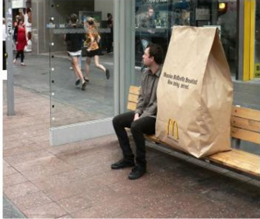
Figure 1: McDonald's adverts