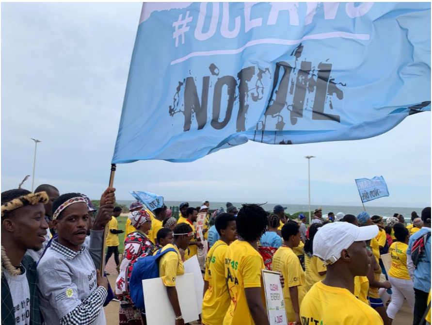
Figure 3. Traditional healers and fisherfolk marching against offshore oil and gas, Durban

'Oceans Not Oil' was the name unanimously chosen for the umbrella body that would build a critical mass of activists, legal support and scientists opposing offshore Phakisa and institute a campaign to address all these concerns (GroundWork 2018).