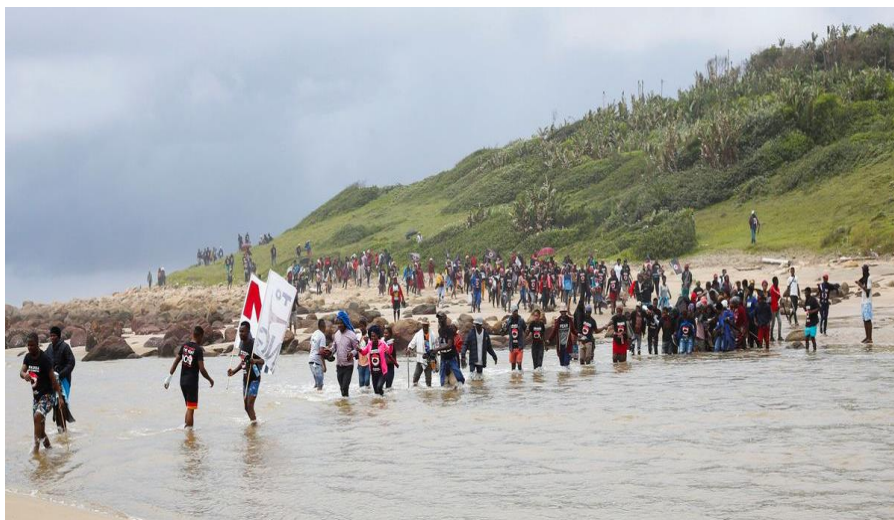
Figure 1. Protesters crossing the Mzamba River during the nationwide Oceans Not Oil protest, 5 th of December 2021